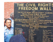
Freedom Wall - Selma Erected - 2005