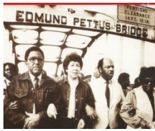
Cross Over the Bridge