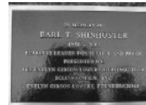
Earl T. Shinhoster Hwy Marker - 85 South - 2001