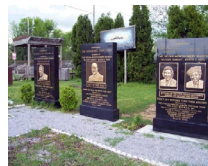
Congressman John Lewis Erected - 2004