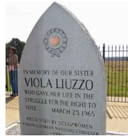
Viola Liuzzo Erected - 1991