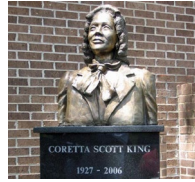
Coretta Scott King Erected - 2007