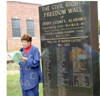
Freedom Wall Perry Co. Erected - 2002