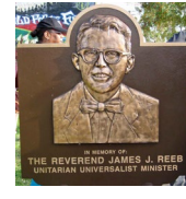
Rev. James Reeb Erected - 2004