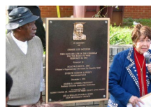
Jimmie Lee Jackson Erected - 1991